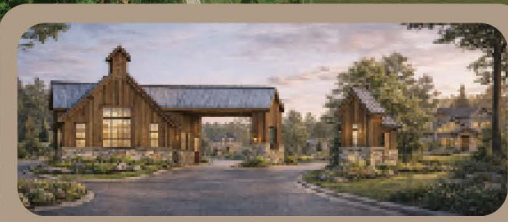
Gatehouse Conceptual Design